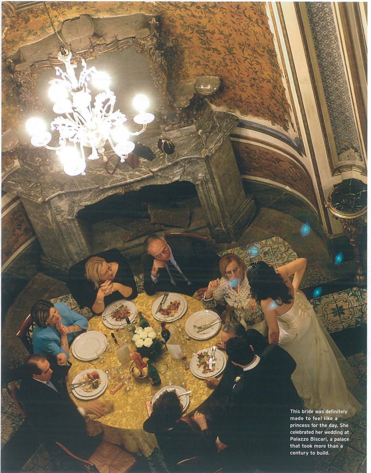
This bride was definitely made to feel like a princess for the day. She celebrated her wedding at Palazzo Biscari, a palace that took more than a century to build.