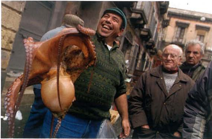
Sicily's food scene is a serious one and the products of Catania are proudly displayed at the fish market (one of Italy's finest) and in the window of a pâtissier who has elaborately crafted fruits from marzipan.

In addition to these well-known landmarks, there is “another side to Sicily,” explains my friend Stefano Aluffi. “If you have the right key,